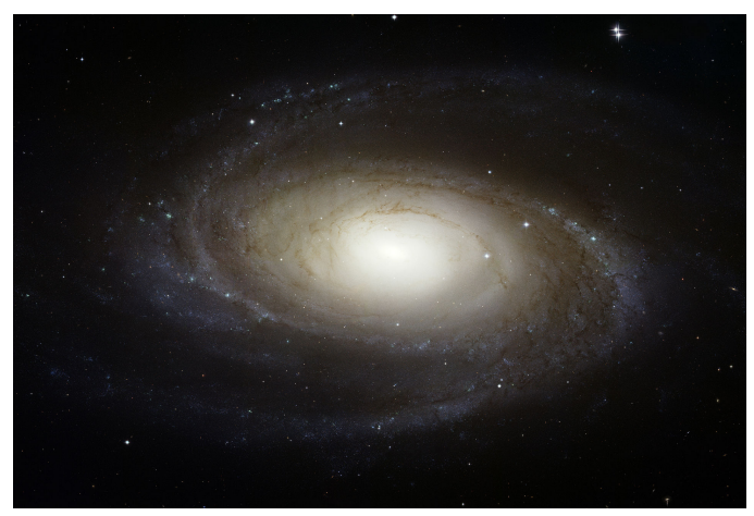
Figure 1: Messier 81 (HST)