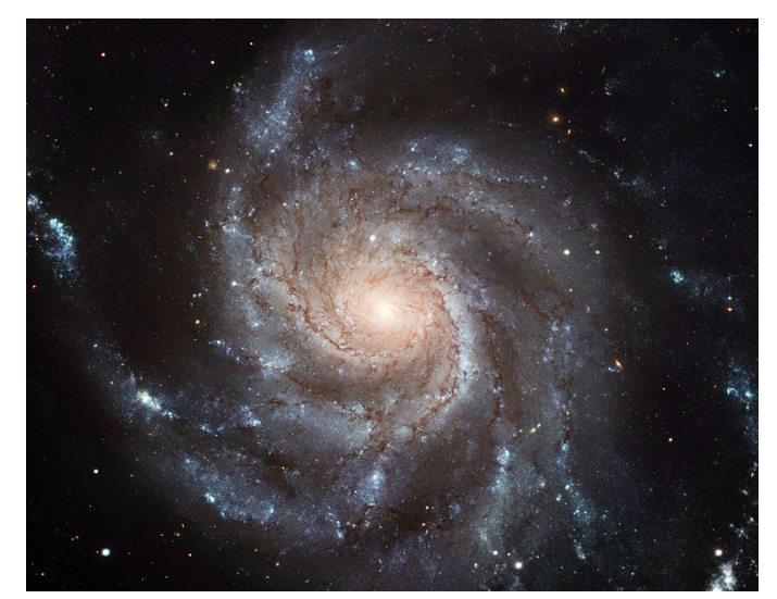
Figure 2: Messier 101 (HST)